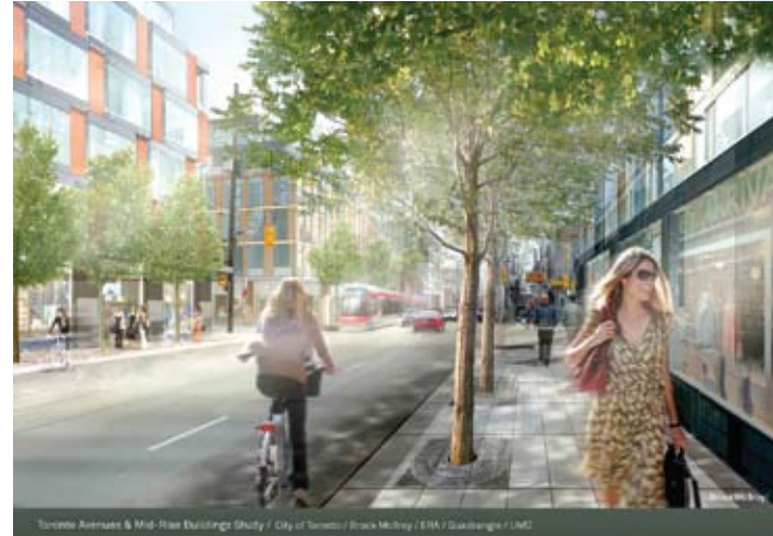
Toronto Avenues & Mid-Rise Buildings Study / City of Toronto / Brook McIlroy / ERA / Gresham / LMC

The Avenues & Mid-Rise Building Study translates the policies for Toronto's "Avenues" into a vision of vibrant, tree lined streets, wide sun-lit sidewalks, framed by well designed, contextually sensitive mid-rise buildings that support an active street life. It guides future growth on the Avenues through a set of performance standards, which provide the foundation for new zoning regulations and urban design guidelines for mid-rise buildings. The complete study can be viewed online at http://www.toronto.ca/planning/midrisestudy.htm .