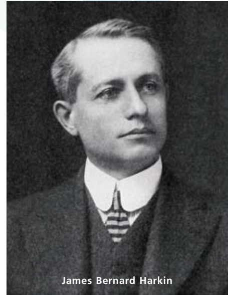
James Bernard Harkin

Due to his visionary activities, James Harkin laid the foundations for Ontario to be home to some of Parks Canada’s most unique and well-loved parks, conservation areas and historic sites. Today, these touch almost every corner of this province.